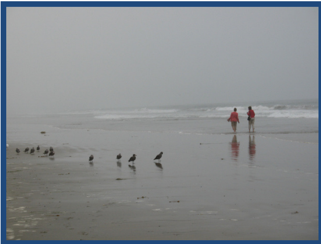
Birds of a feather flock together...at Solana Beach. The red ones are CACSS members.

You can find many more California Trip Photos at photobucket.com . Enter the username "cacss" and the password "succulent." There are two albums. Select the one named "CACSS 2010 Calif Trip" and start the slide show (button in upper right hand corner).